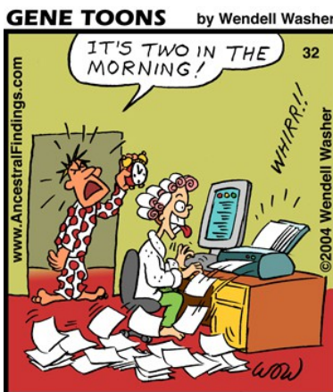
Hot on the trail.

We can be found at: https://www.facebook.com/cdfhs