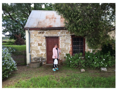
Illustration 2: Maitland Cottage