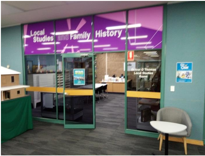
The New Family History Room at Campbelltown Library.